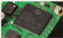
32-bit High Speed Floating Point DSP

The 32 bit high speed floating Point DSP (max 3000 MIPS) provides effective cancellation/reduction (DNR) of the random noise that is frequently frustrating in the HF frequencies. Also: the AUTO NOTCH (DNF) automatically eliminates the dominant beat tone. The CONTOUR, and the APF, are very effective receiver noise reduction tools in the HF bands operations. The YAESU original DSP QRM and noise reduction functions are provided.